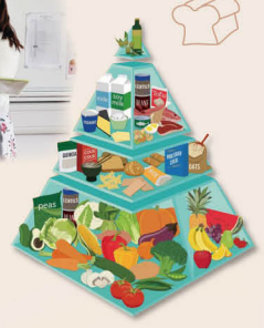
Students share their knowledge.