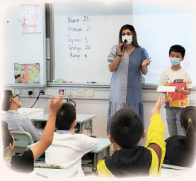
Sharing extreme sport ideas with the class