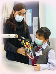
Show and tell is fun!