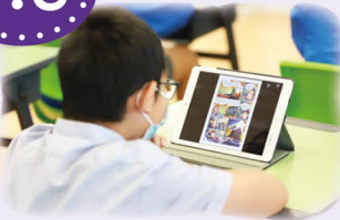
Learning English through comics is fun.