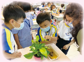
Learning all about growing plants