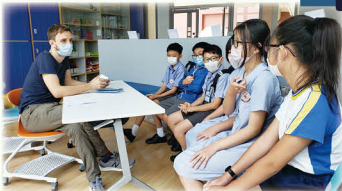
Students practise their interview skills.