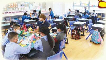
Then we split into 5 small groups.