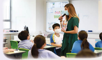
Sherlock Holmes is the most popular detective series in our class.