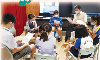
NETs training students for the "Read Out Loud Competition"