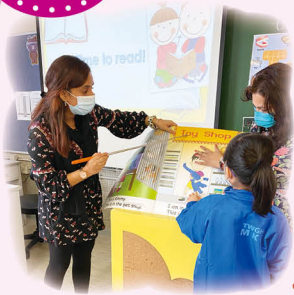
Where is Tom?