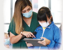
Let's search for different genres of books together!