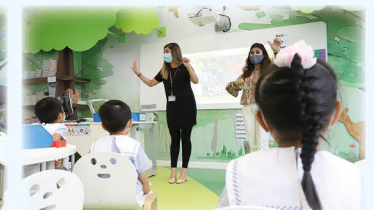
How many frogs can you see? Let's all count together.