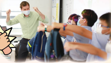
Test of strength!