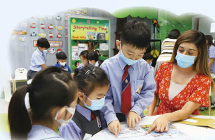
What happened next?