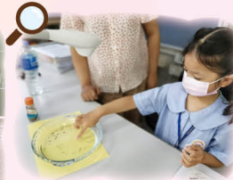
Science lesson: Wash your hands to keep the germs away!