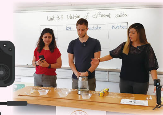
Today we will do an experiment and see how fast things melt.