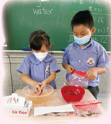
Let us teach you how to grow plants.