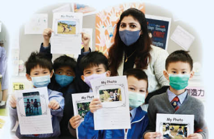
All about my photo