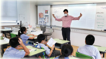
Make sure your voice is loud and clear!