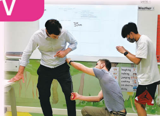
Let's measure our bones!