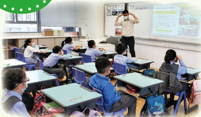
Students learn in a whole-class setting.