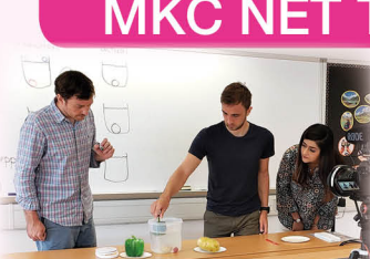
Float or sink?