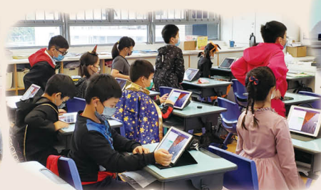
Students enjoy an end-of-lesson iPad game.