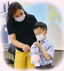
My favourite toy is a dinosaur.