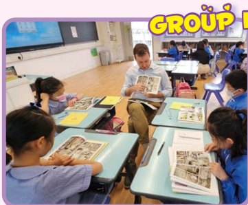
Students split into small groups after whole-class learning.