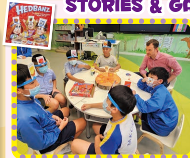
Having fun during recess playing Hedbanz (Headbands)