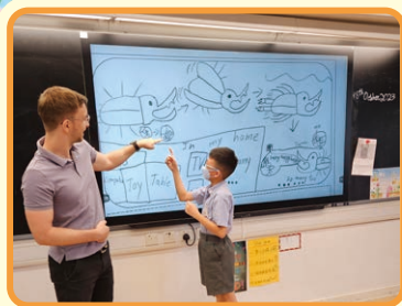
Writing about useless inventions