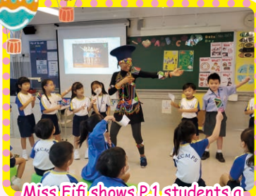
Miss Fifi shows P.1 students a South African dance.