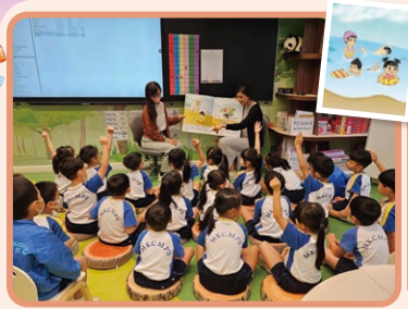
Big book reading fun with students