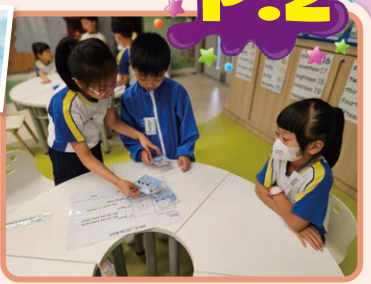
Happy faces after finishing the sentence sequencing task