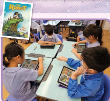
Students captivated by The Little Robot's thrilling adventures