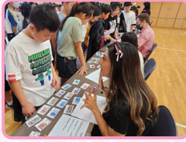
Shopping with foreign currencies