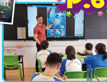
Students help to read aloud as characters in the "Amulet" reader.