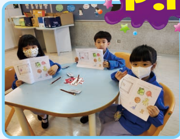
Doing classwork in their booklets