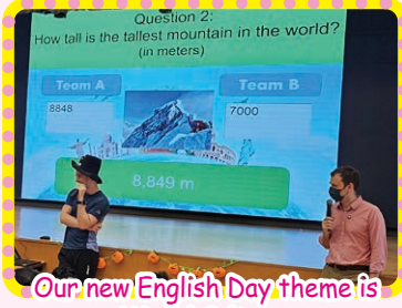
Our new English Day theme is World Culture.