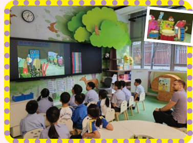
Some laughter time watching a movie with Mr Whittle