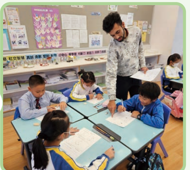
Students making a single fusion dish