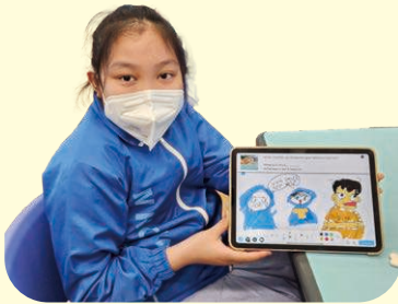
Students write a Doraemon comic book ending.