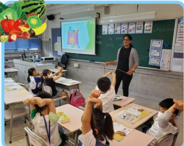
Learning the difference between healthy and unhealthy food