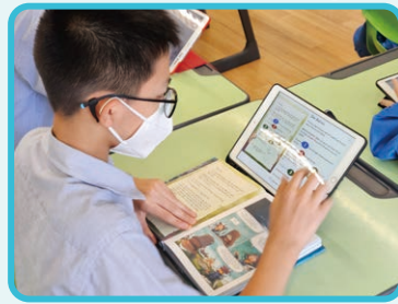
Students do reading comprehension exercise.