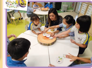
Playing Dobble and feeling excited