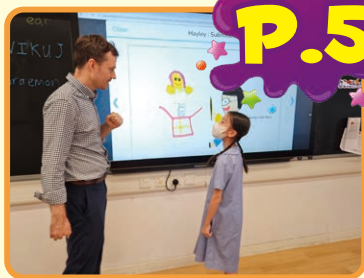
Sharing with the class