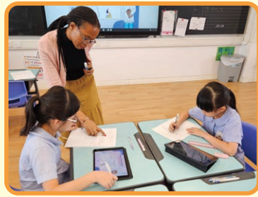
How can I write this sentence?