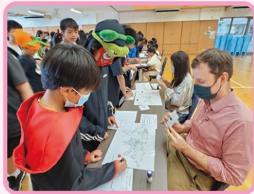
Find the country!