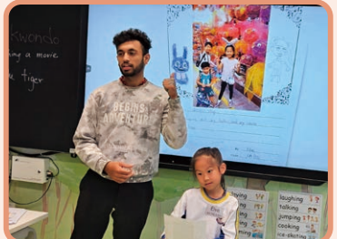
Student sharing memories