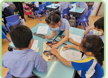
Students using the reader to complete the crossword