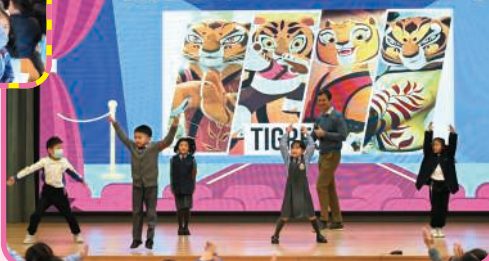
Who will win the Stamina challenge?