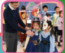
We are from Zootopia!