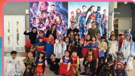
P.3 students dressing as their favourite storybook heroes