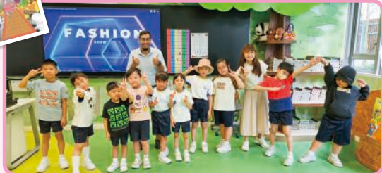
Students are having a fashion show, oh what a great time!