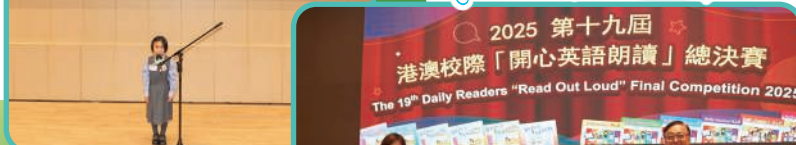
Future orators in the making