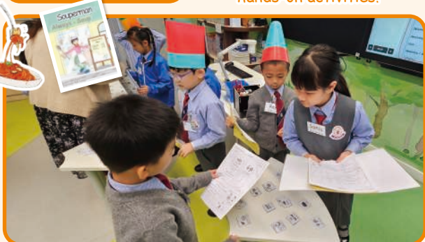
Restaurant Role Play in Action! Students step into the roles of chef, waitress, and customer in this engaging interactive activity.