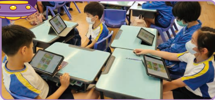
Group reading on our iPads