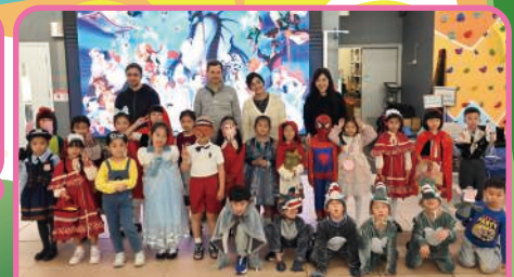
P.2 students showing us their amazing costumes