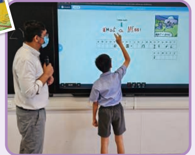
Decoding a mysterious alien language