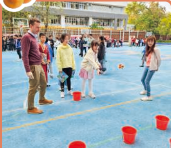
Students try to read words and toss tangerines into the baskets.