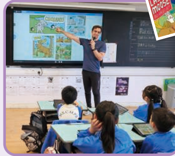
Enjoying the hilarious hijinks of Laser Moose