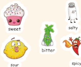
Exploring Flavors! Students engage in a fun exploration of taste, learning about sweet, salty, bitter, and spicy through hands-on activities!