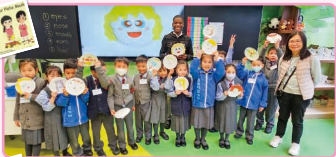
Yay, what a fun activity! Let's take a group photo.