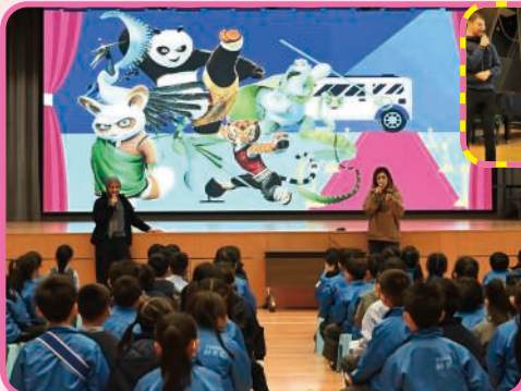
English Fun Day's theme this year was movies.