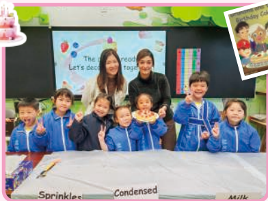
Would you look at that! ... Who is ready to taste a cake?