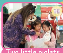
Two little piglets