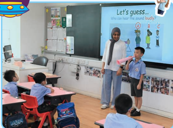
Miss Fadia shows students how to use a paper megaphone to make their voices sound louder.