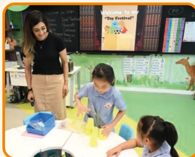
Welcome to our Toy Festival! Students are excited to share their favourite toys in a fun show. Let the fun begin!